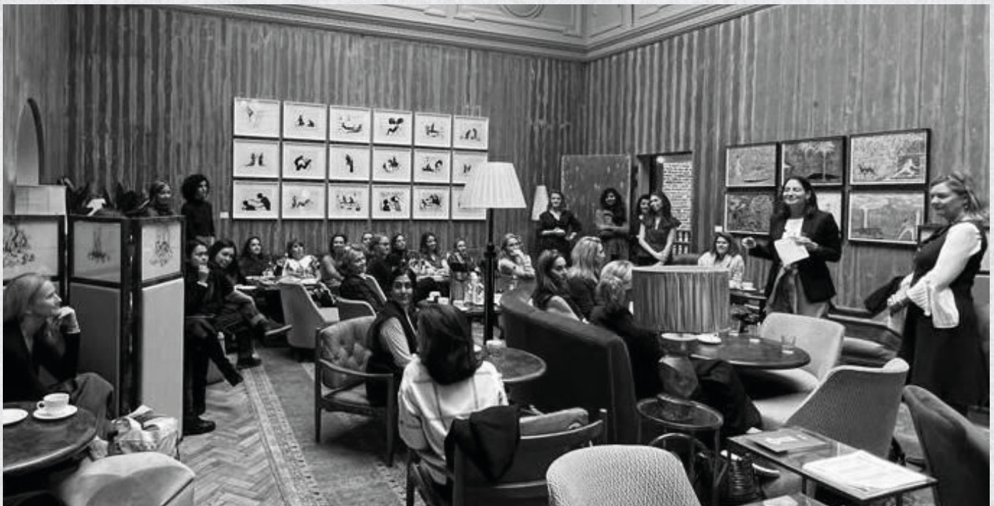
Members' event, Royal Academy of the Arts, Nov 2022

The Annual Grant Awards Events enables our members to hear directly from our charity finalists before casting their votes.