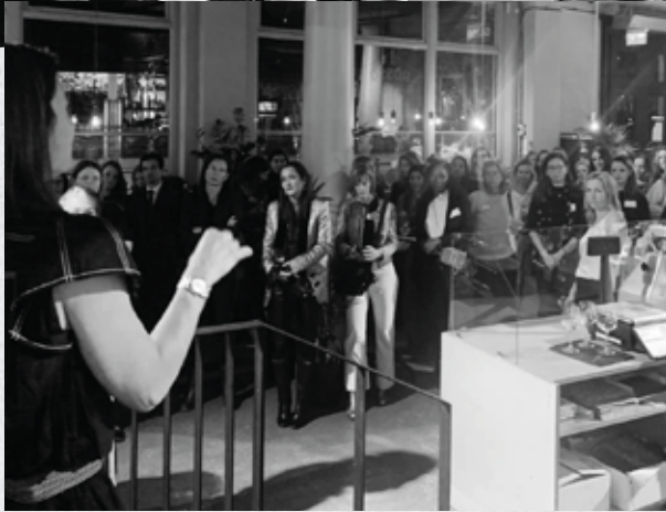
Members' Drinks, Enoteca Rosso, March 2022