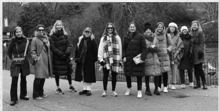
Members' Walk, St James Park, January 2022

"One of the highlights of the night was meeting other members. We share so many things in common in addition to our goal of supporting women and girls. I had many interesting conversations!"